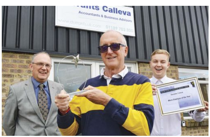
Micro Employer of the Year Sponsored by Dovetail Recruitment Durrants Calleva