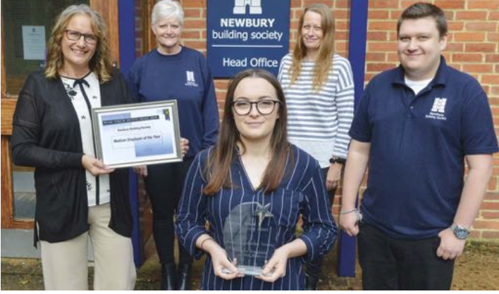
Medium Employer of the Year Sponsored by EJBC Chartered Accountants